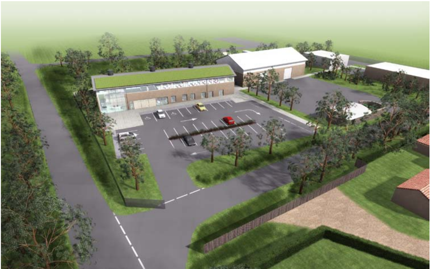
Artist impression of proposed operational base.